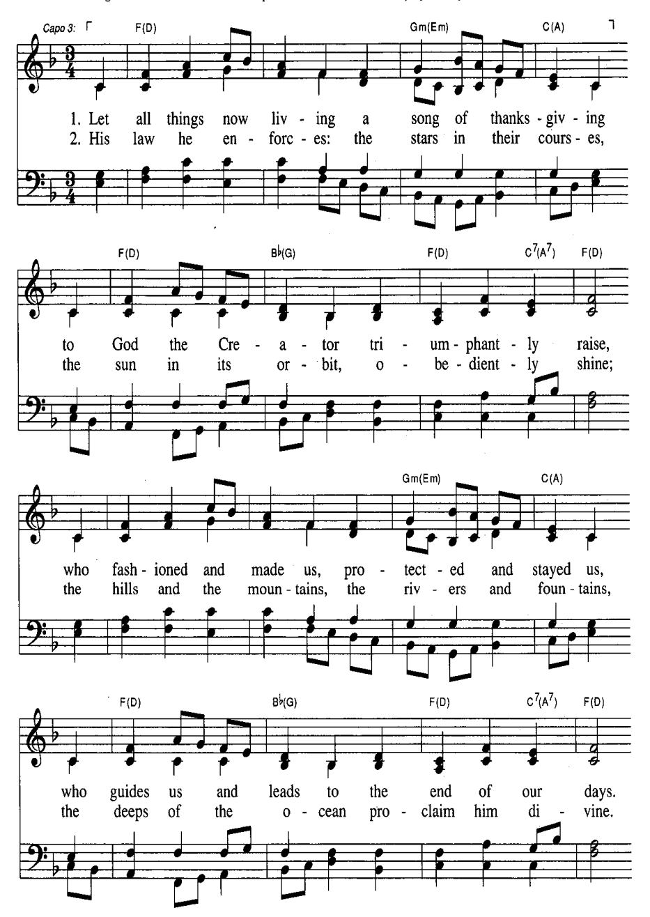
Sing to the LORD, all the earth; proclaim his salvation day after day. 1 Chron. 16:23